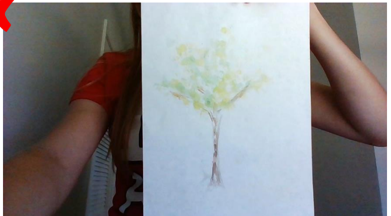
Uncropped with Distracting Background