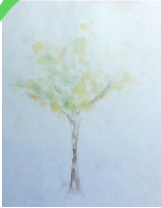
Bright Light Source