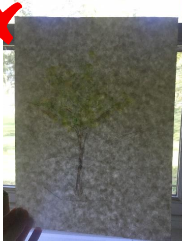
Backlighting ( light source behind artwork )